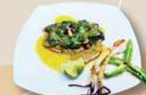
Spinach Rib Eye Steak