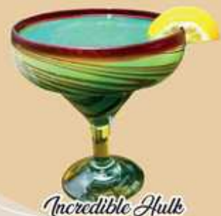
Incredible Hulk Margarita $23.99