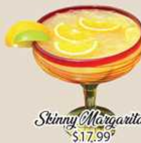
Skinny Margarita $17.99