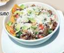
Tazon de Nachos