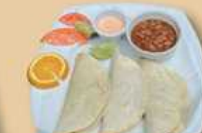
Taco Roc Plate