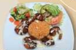
Camarones Don José