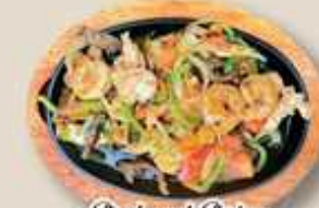
Steak and Shrimp