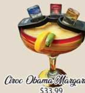
Ciroc Obama Margaritas $33.99