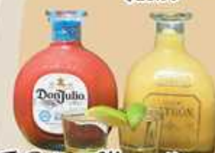
El Patron Margaritas $28.99