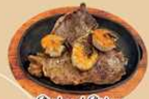
Steak and Shrimp