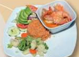
Camarones al Mojo de Ajo