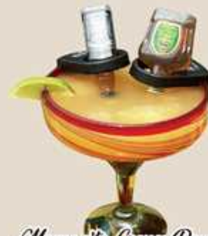
Mamacita Crown Roya Apple Pie $28.99