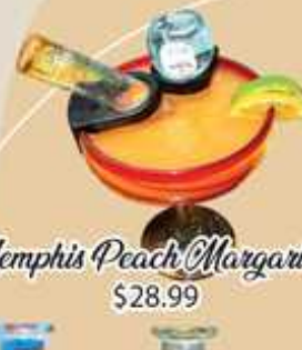
Memphis Peach Margaritas $28.99