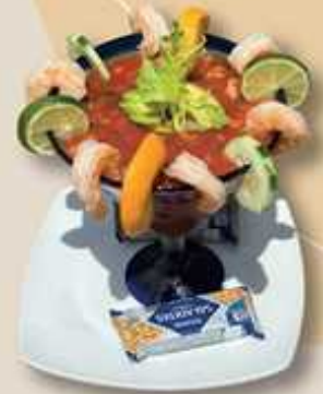
Coctel de Carones