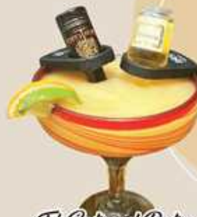
El Gato y el Raton $28.99