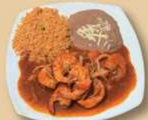
Camarones a la Diabla

Cilantro, lime, rice layered with black bean, grilled shrimp, pineapple, avocado and cilantro.