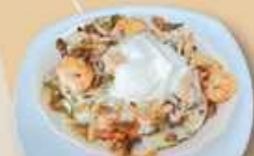
Margarita's Baked Potato