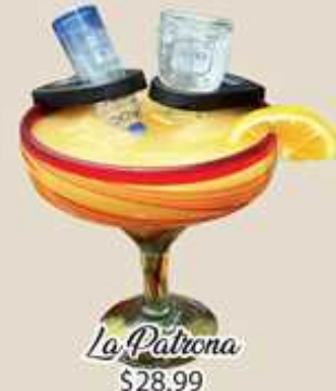
La Patrona $28.99