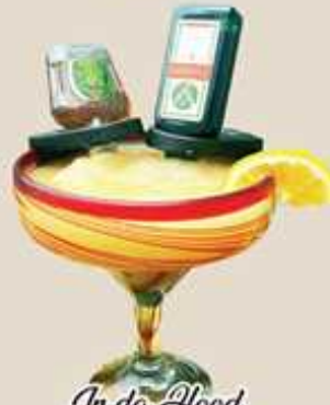
In da Hood $28.99