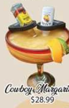
Cowboy Margaritas $28.99