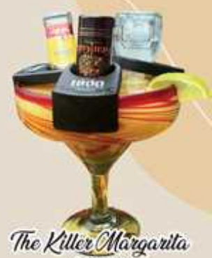
The Killer Margarita $33.99